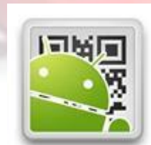
QR Droid (Available for Android Devices at the Google Playstore)

To utilize these applications simply open the program, and point your phone camera at the QR Symbol of your choice. Your phone will do the rest!