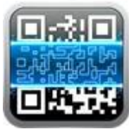
QR Scanner (available on the iPhone APP Store)

If you do not have a QR scanner on your phone, you can install one of the following free scanners from the iPhone App Store or the Google Play Store: