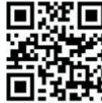
CPFMC ONLINE DONATION PAGE

If you do not have a QR scanner on your phone, you can install one of the following free scanners from the iPhone App Store or the Google Play Store: